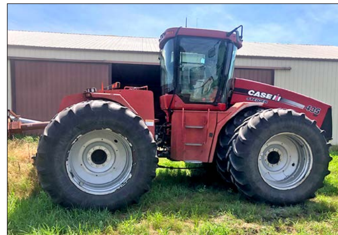
Owner: Lloyd Francis Farms, Inc.

DeWITT AUCTION CO. 220 DeWitt Drive Sikeston, MO 63801